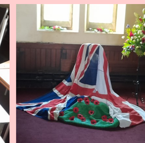
80th D Day Commemoration